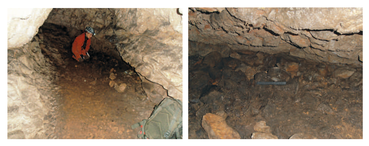
Fig. 2. The gallery with the Cotofeni deposition.

The first is located in the area of the cave entrance, where strongly rolled fragments of pottery were found, while the second is located ca. 15 meters apart, in a diverticulum on the left wall. One cannot exclude the possibility that the pottery fragments at the entrance were rolled on this spot during strong freshets inside the cave.