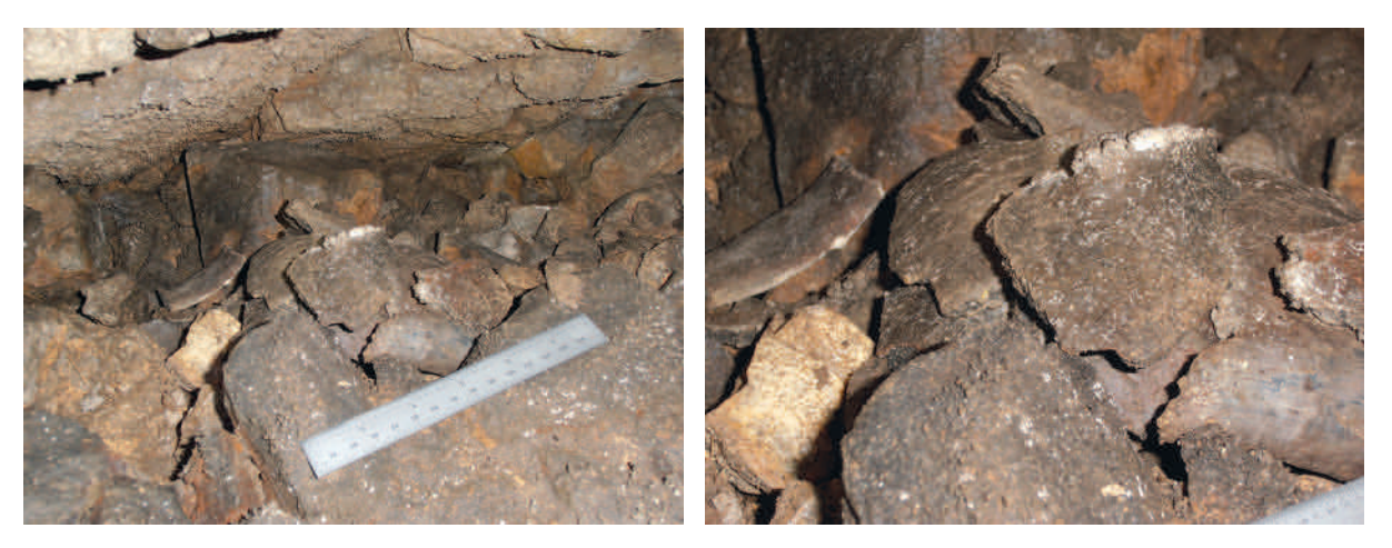
Fig. 4. Detail the Coţofeni deposition.